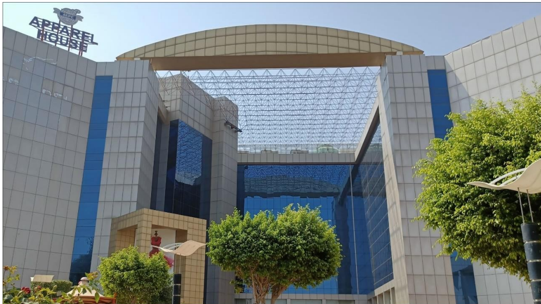
THE APPAREL HOUSE

Apparel Export Promotion Council (AEPC) , Incorporated in 1978, AEPC is the official body of apparel exporters in India that provides invaluable assistance to Indian exporters as well as importers/international buyers who choose India as their preferred sourcing destination for garments. It has Head Office in Gurgaon with Registered Office at Okhla and 8 offices pan India. The Head Office is in a prime venue in the heart of Gurgaon in Institutional Area near Huda City Centre known as "Apparel House".