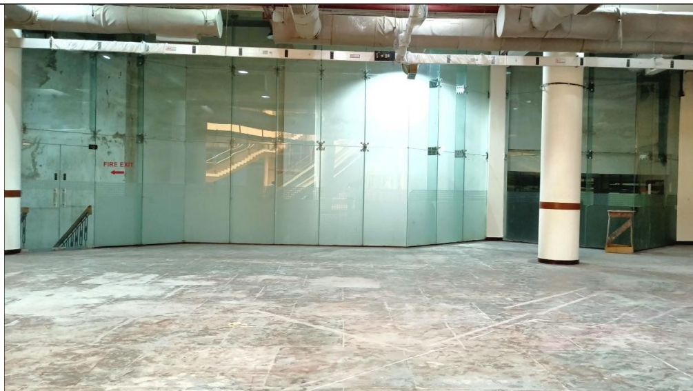
EXHIBITION HALL - C