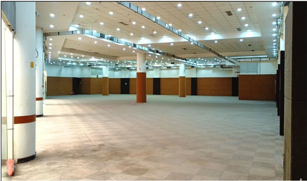
EXHIBITION HALL - A

Apparel House also has Exhibition Hall consisting 3 halls (Ground and first floor) of approximately 40,000 sq.ft in which several fairs and exhibitions are held on a regular basis.